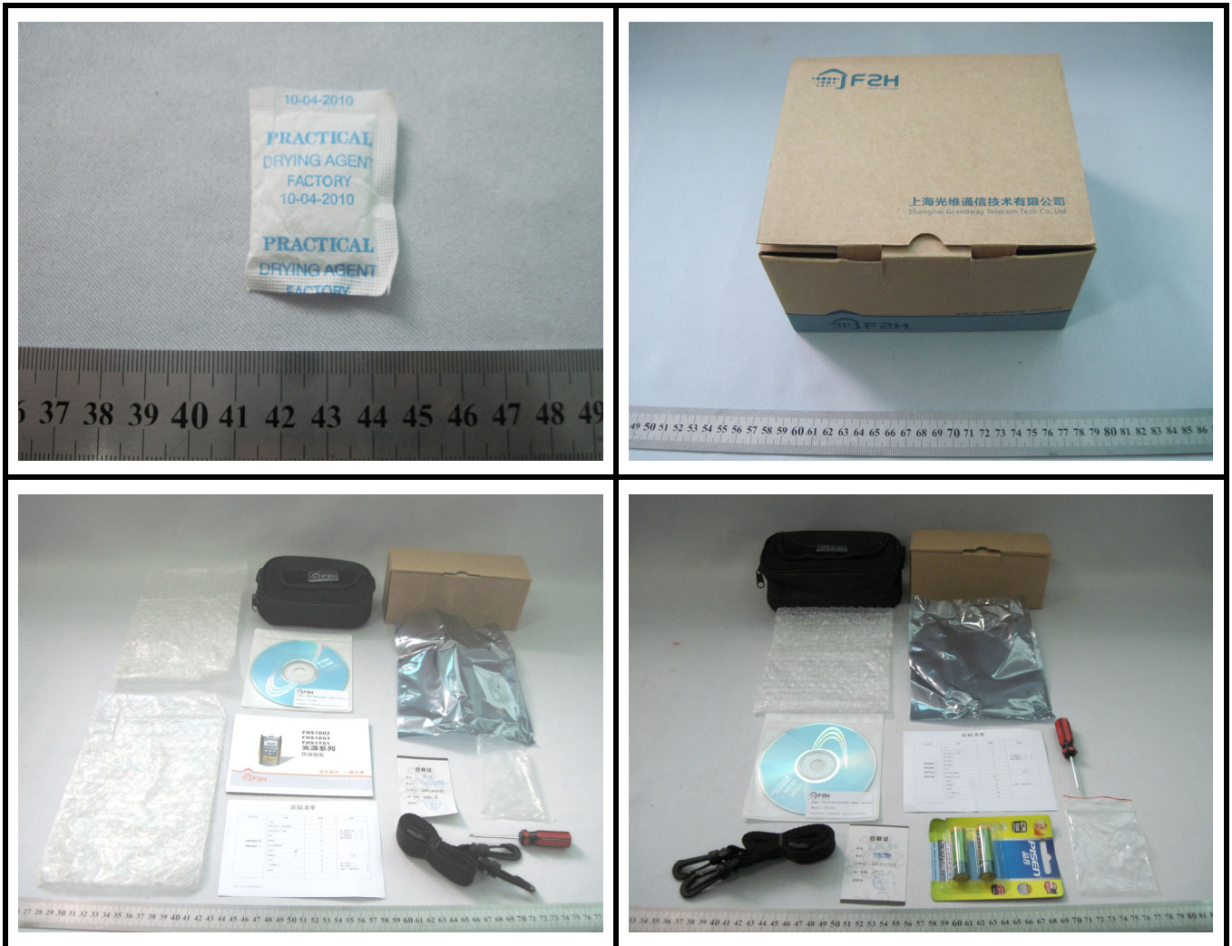
Photograph of Sample

BACL authenticate the photo on original report only